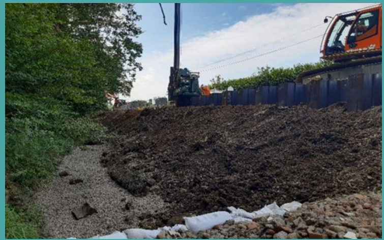
Installation of the sheet piles on the northern wall