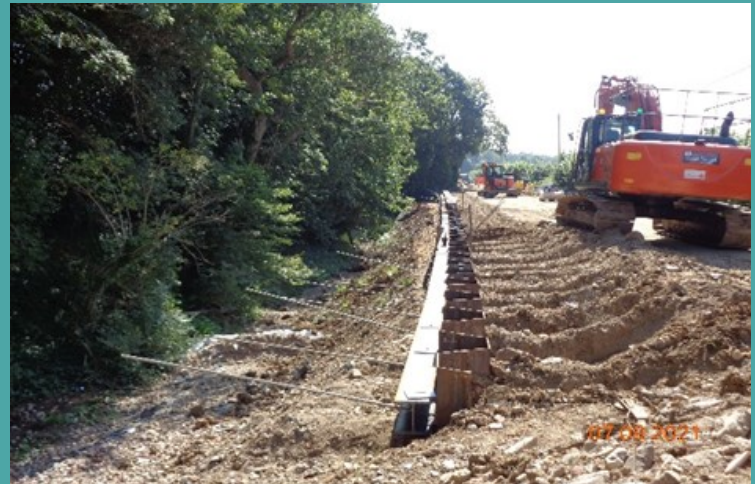
Installation of anchors and capping beam to southern wall