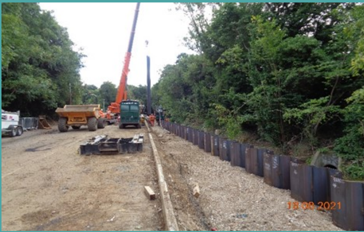
Installation of the sheet piles on the northern wall