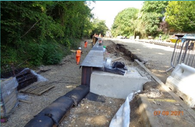
Placing the capping beam to the top of northern wall